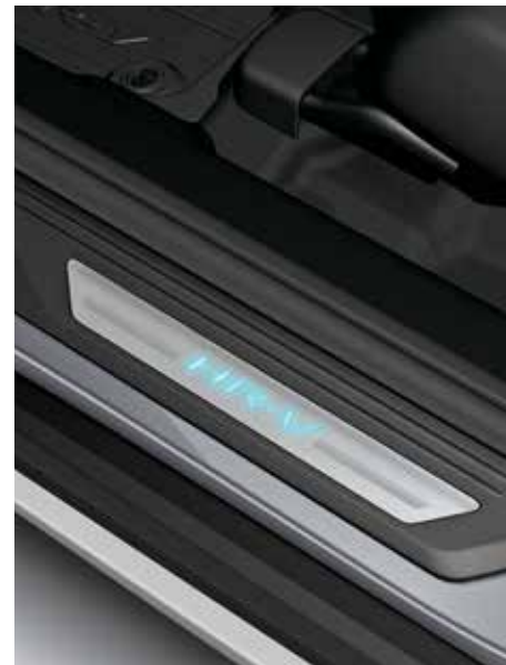
ILLUMINATED DOOR SILL TRIM