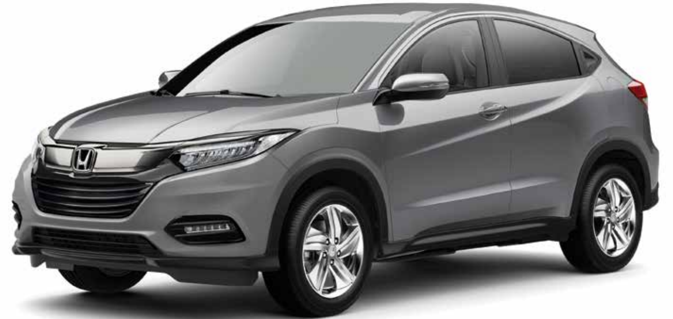
HR-V EX shown in Lunar Silver Metallic