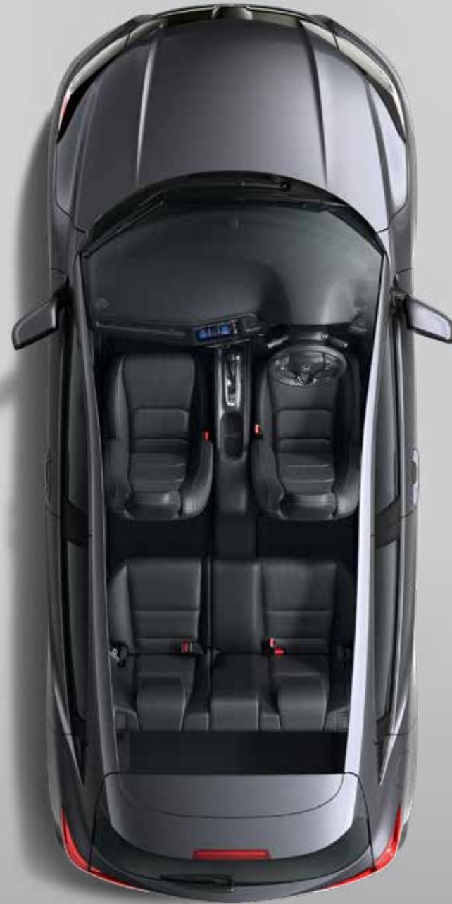
HR-V EX shown in Modern Steel Metallic

A unique and dynamic appearance along with a solid stance and couple-like cabin shape give the HR-V a bold look. Whichever way you look at it, the HR-V is a luxurious and sporty piece of machinery.