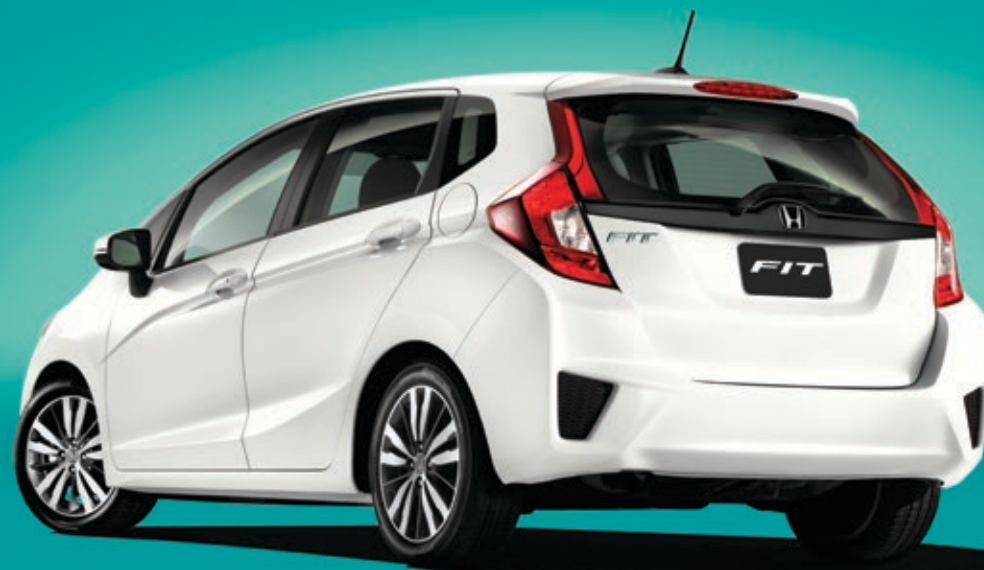
Honda Fit Sport shown in: Premium White Pearl

The Fit has been completely redesigned and it's ready for action. It has a slick, new body design and a wider stance. And it all helps give the Fit a look that, for a compact car, is pretty tough.