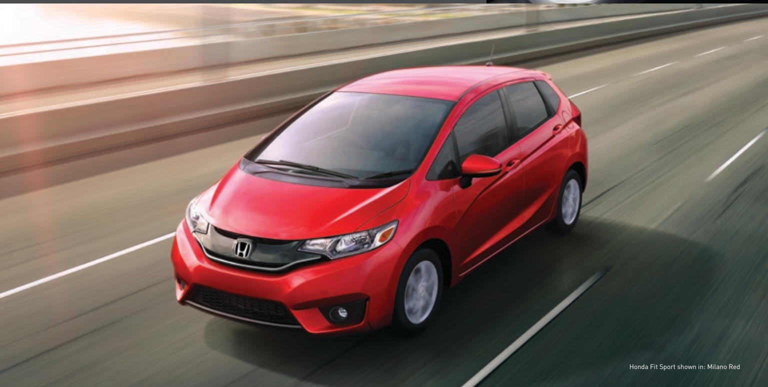
Honda Fit Sport shown in: Milano Red

During an understeer or oversteer condition, VSA 7 brake individual wheels and/or reduce engine power to help restore your intended course.