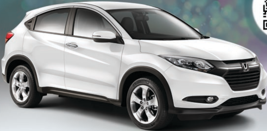
HR-V shown in: White Orchid Pearl